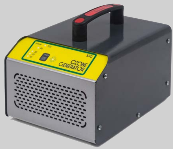
OZONE GENERATOR 10G

Or you sell/rent a house formerly faced fire damage or flood or water damage. In such cases, even the place cleaned and painted, smoke, which deeply penetrated every crack keeps producing odor. A Mildew odor is a real problem after flood or water damage. To run the Ozone Generator for several hours and longer depending on the odor will help you to get rid of these problems. Now you are ready for "Open House Day".